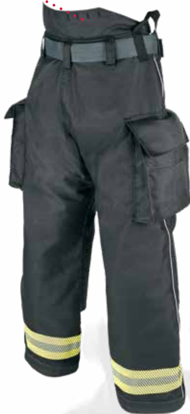
Style OSX BP3307G91 shown above in Standard OSX B2 Material Configuration