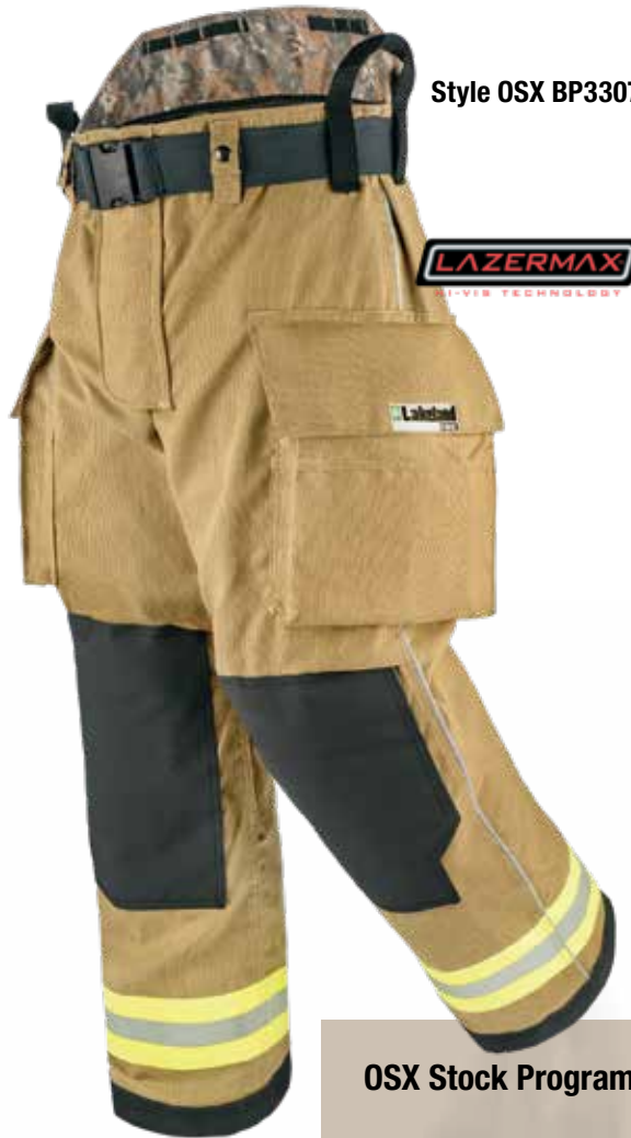
Style OSX BP3307G91