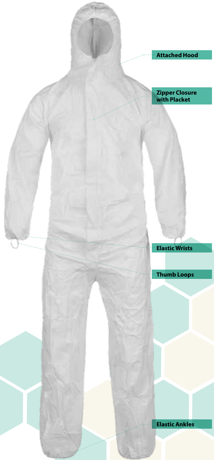
Garment Case Pack: 25/case, individually packed

CleanMax® garments feature bound seams, which are precisely sewn with an additional outer binding. This increases seam strength and provides a better barrier from particulates than simple serged seams.