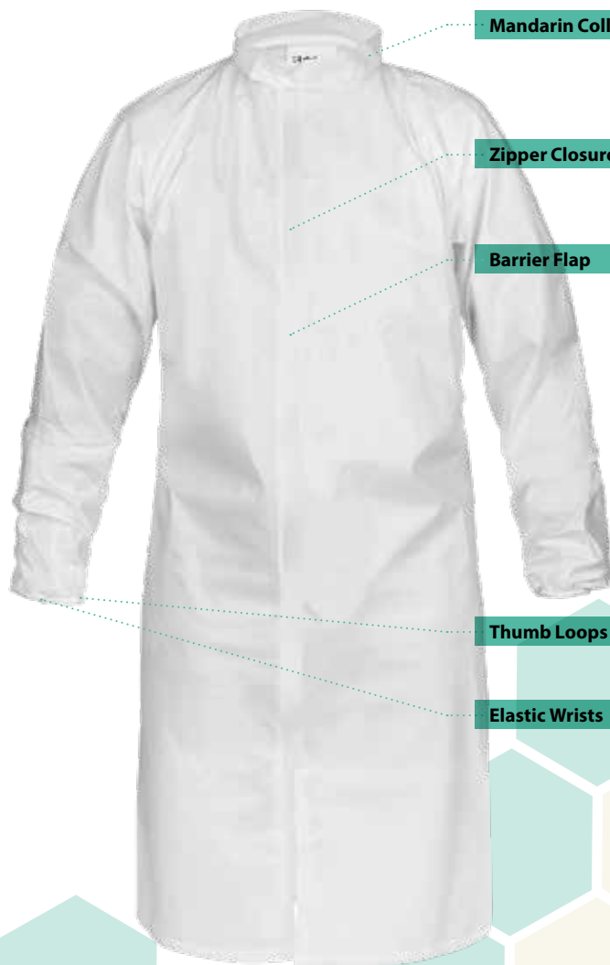
Garment Case Pack: 30/case, individually packed

CleanMax® garments feature bound seams, which are precisely sewn with an additional outer binding. This increases seam strength and provides a better barrier from particulates than simple serged seams.