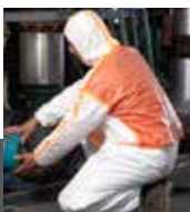
MicroMax® TS Cool Suit