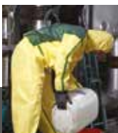
ChemMax® 1 Cool Suit