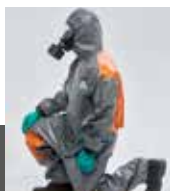
ChemMax® 3 Cool Suit