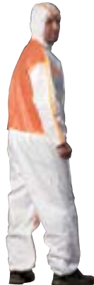
MicroMax® TS Cool Suit