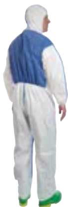
MicroMax® NS Cool Suit