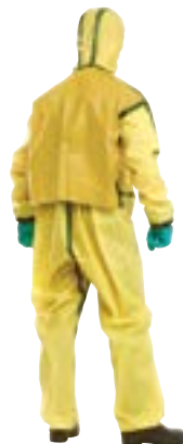
ChemMax® 1 Cool Suit