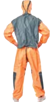
Pyrolon™ CRFR Cool Suit