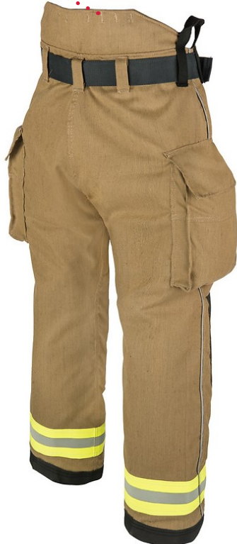
Style OSX BP3307G91 shown above in Standard OSX B2 Material Configuration