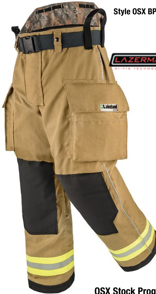
Style OSX BP3307G91