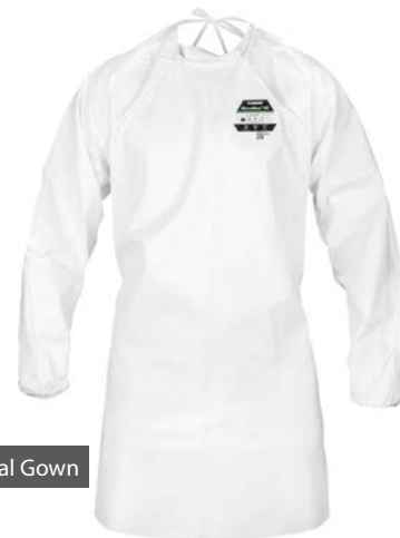
EMN527 - Hospital Gown