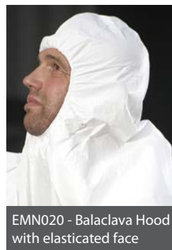
EMN020 - Balaclava Hood with elasticated face