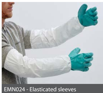
EMN024 - Elasticated sleeves