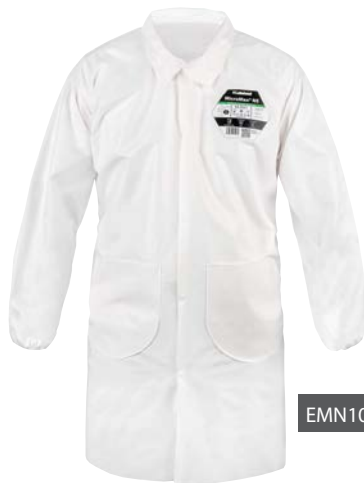
EMN101 - Lab Coat

A selection of MicroMax® NS accessories for flexible and comfortable protection in various applications