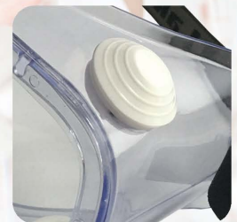
4 indirect ventilation slots