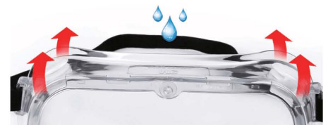
Waterproof and Breathable