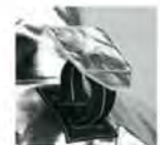
3. "Easy Grip" DRD